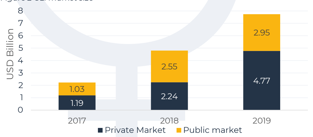
Figure 2 GLI market size

Despite numerous studies demonstrating the benefits of investing in GLI vehicles, the percentage of impact investing funds that address SDG 5 remained at only around 8% in 2020, according to Phenix Capital<sup>XVII</sup>. On a more positive note, gender-smart investing is gaining significant traction, with a growth of more than 60% from 2018 to 2019 alone according to Project Sage 3.0, a report published by Wharton Social Impact Initiative and Catalyst at Large<sup>XVIII</sup>. It has spread far beyond its microfinance roots, including private equity, venture capital, public vehicles, bonds, and other investment assets. While in 2018, USD 4.77 billion were invested in vehicles with a GLI approach, by 2019, assets under management (AuM) had already reached USD 7.7 billion, invested across 192 vehicles (Figure 2).